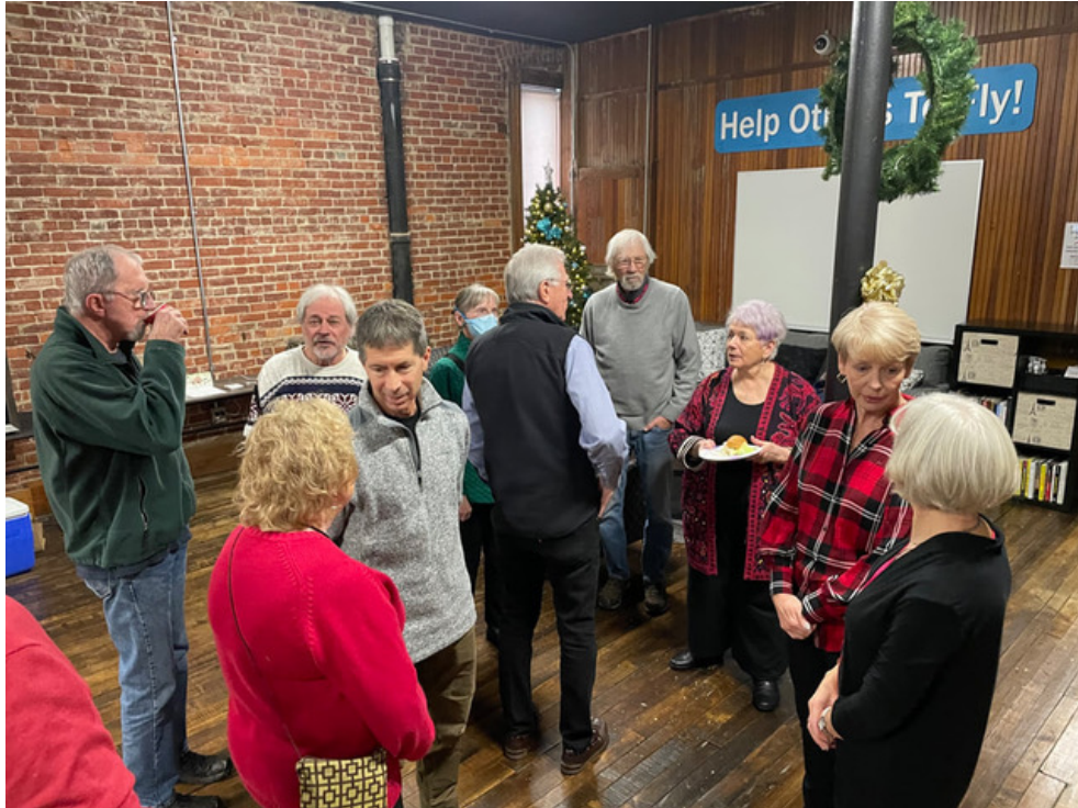
Celebrating Christmas at our new location.