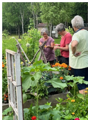
Garden visit at a friend’s home.

In 2024 I will begin the search for a part-time administrative assistant, one attuned to our mission and well versed in technology and the various aspects of communication. A new year opens opportunities for growth and positive development. As the saying goes, “the best is yet to come.”